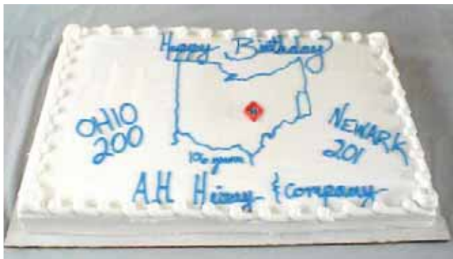
The Celebration Cake