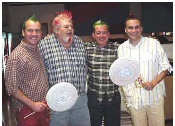
It's those loveable Heisey Pop Guys

The Heisey Pop Guild performed a song to the tune adapted from the Wizard of Oz. It was dedicated to all the first time convention attendees who were