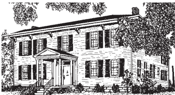
Visit The National Heisey Glass Museum

Contact the HCA Administrative Office at (740) 345-2932 for more information. The Endowment Committee wishes to thank those who have become Endowment Members and all of the individuals and study clubs that have so generously supported the HCA Endowment Fund. Your support will make the museum self-sustaining in the years to come. Thank you all! ♦